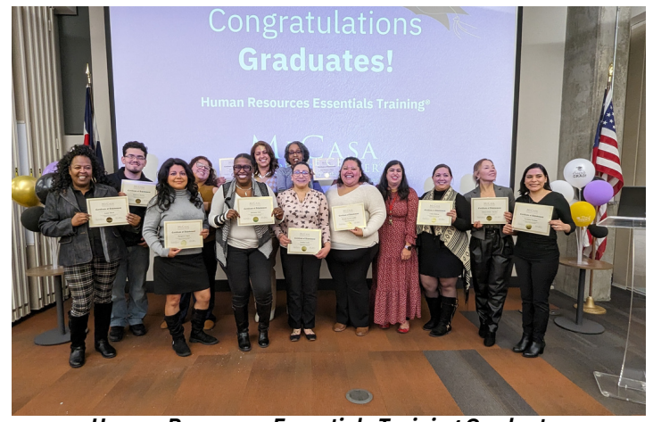
Human Resources Essentials Training Graduates