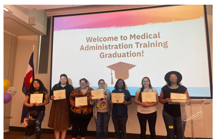
Medical Office Administration Training Graduates