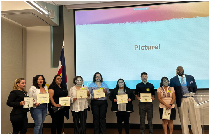
Financial Services Training Graduates

This summer, Mi Casa celebrated the graduations of two training courses. The Financial Services Training had a graduation on August 2nd and the Medical Office Administration Training held its graduation on August 15th. The next Human Essentials Resources cohort will have their first training session on August 23rd.