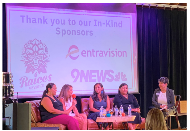
Las Jefas and Jefes in the Making 2022